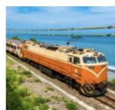
huǒ chē 火車