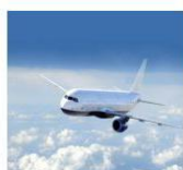
fēi jī 飛機