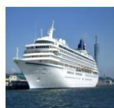
lún chuán 輪船