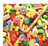
táng guǒ 糖果