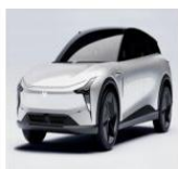
qì chē 汽車